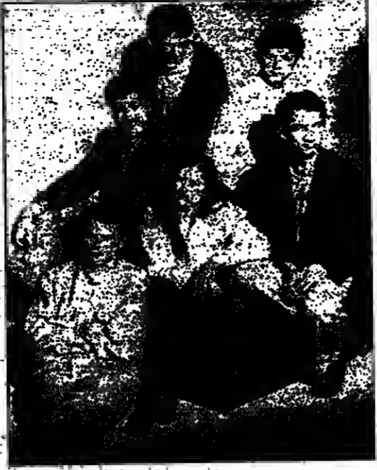
British early-music ensemble I Fagiolini sings in Tel Aviv.